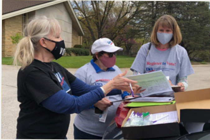
Members of LWVGO prepare for a VoterCade.