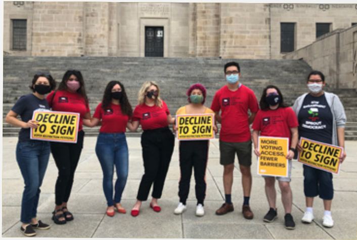
Nebraska Table staff, as part of the Decline to Sign coalition, say no to Voter IDs.