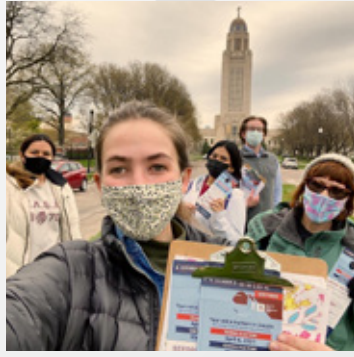
Organizers share election information.