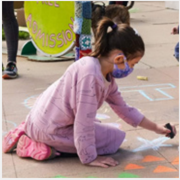
Civic engagement starts early.